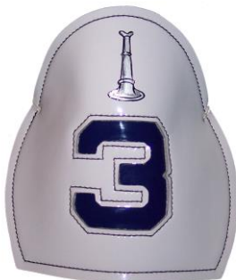
Standard Boston Style, With Painted Graphic Style #5014