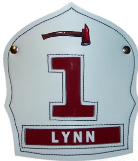
Standard Traditional Style, One Text Panel and Painted Graphic Style #7015