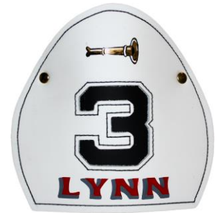
Standard Boston Style, With Painted Graphic & Text Style #5022