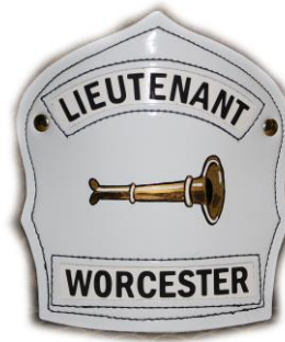
Standard Traditional Style, With Text Panels and Painted Graphics Style #7012