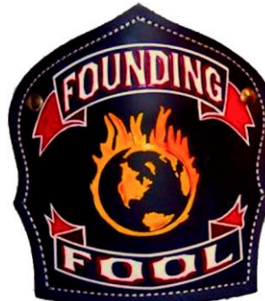
Standard Traditional Style, Banner Style 7 Style #8017