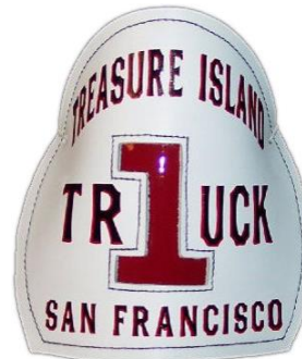
Standard Boston Style, Painted Graphic and Two Lines of Painted Lettering Style #5017