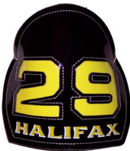
Standard Boston Style, One Line Painted Lettering Style #5015