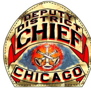
Standard Boston Style, Banner Style 3 Style #6013