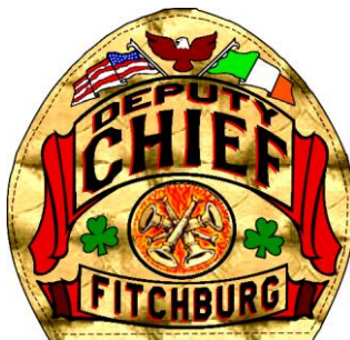
Standard Boston Style, Banner Style 5 Style #6015