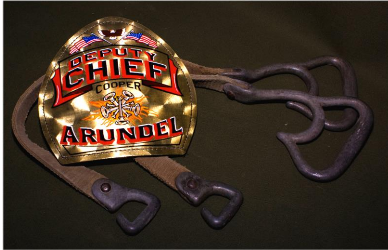
Standard Boston Style, Banner Style 10 Style #6019