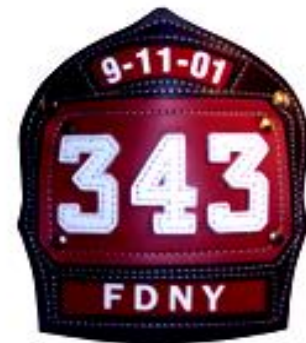
Traditional Style, With FDNY Style Insert and Two Text Panels Style #7018