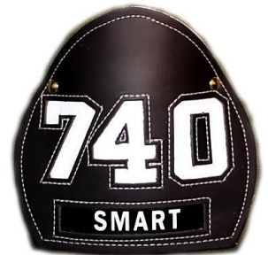
Standard Boston Style, Three Numbers and Stitched Text Panel Style #5021