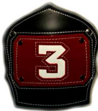
Traditional Style, With FDNY Style Insert Style #7016