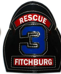
Standard Boston Style, With Two Text Panels Style #5013