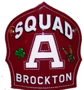
Standard Traditional Style, With Painted Text and Painted Graphics Style #7013