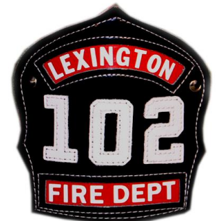
Standard Traditional Style, Two Text Panels and Three Numbers Style #7020