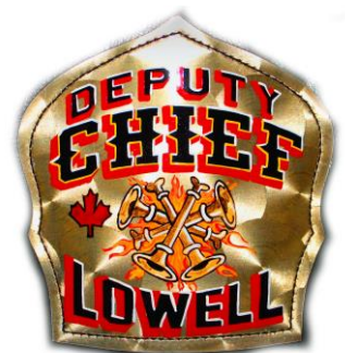
Standard Traditional Style, No Banners Style #8024