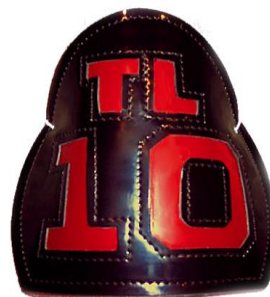
Standard Boston Style, Stitched Top Characters Style #5020