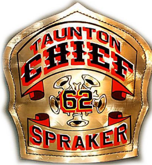
Standard Traditional Style, Banner Style 2 Style #8012