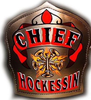
Standard Traditional Style, Banner Style 3 Style #8013