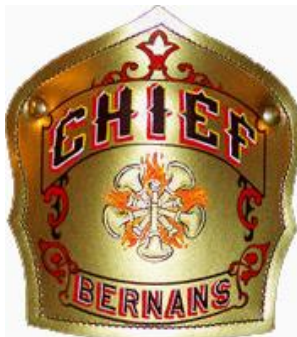
Standard Traditional Style, Banner Style 11 Style #8022