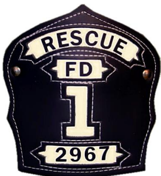
Traditional Style, With Pointed Text Panels Style #7021