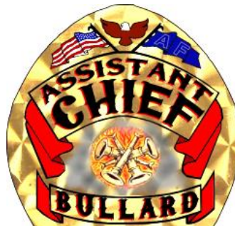
Standard Boston Style, Banner Style 6 Style #6016