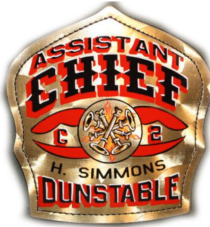
Standard Traditional Style, Banner Style 6 Style #8016