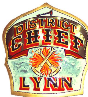
Standard Traditional Style, Banner Style 12 Style #8023