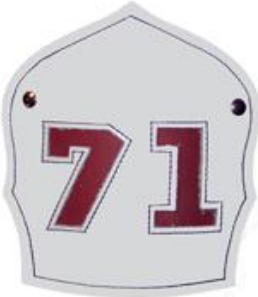
Standard Traditional Style, No Graphics Style #7010