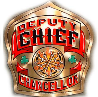
Standard Traditional Style, Banner Style 4 Style #8014