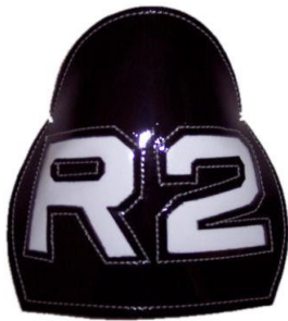
Standard Boston Style, No Graphics Style #5011