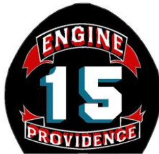
Standard Boston Style, Banner Style 2 Style #6012