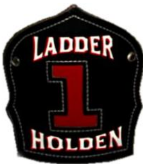
Standard Traditional Style, Two Lines Painted Lettering Style #7014