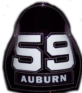
Standard Boston Style, With One Text Panel Style #5012