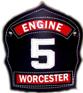
Standard Traditional Style, With Text Panels Style #7011