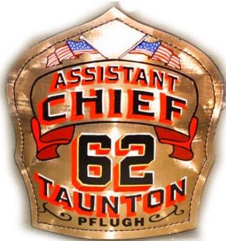
Standard Traditional Style, Banner Style 1 Style #8011