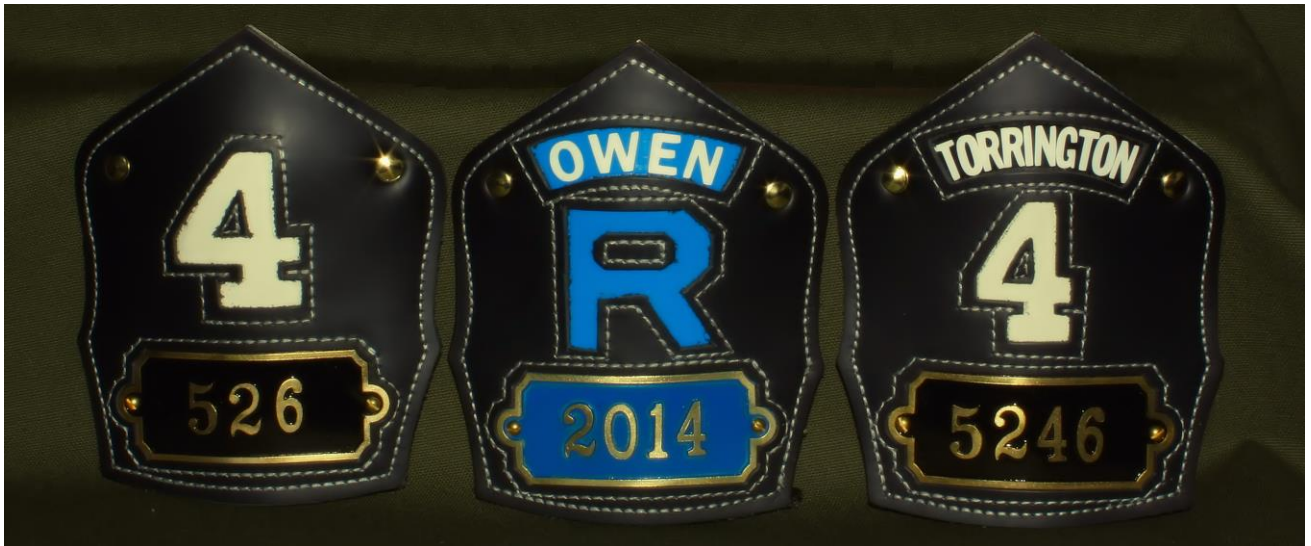
Chicago Style Front Style #8030

For many years Chicago firefighters prominently displayed their individual badge number on a badge plate that was inset into the leather helmet front. We are proud to offer this style in our line of helmet fronts. The Chicago front comes in a standard 6 inch tall profile has a 5 inch width and features a stitched inset for the Chicago style badge plate. We build each badge plate from scratch out of solid brass to the correct shape and size of the original design. Badge plates can be finished in your choice of red, black, blue, or green enamel. Chicago style fronts can be made with any of our standard materials and finishing options. Badge plates can also be ordered separately.