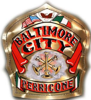
Standard Traditional Style, Banner Style 10 Style #8021