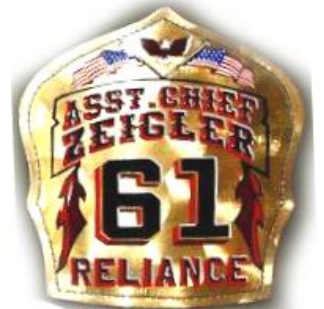
Standard Traditional Style, Banner Style 8 Style #8018