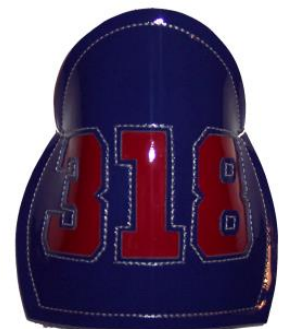
Standard Boston Style, With Three Numbers Style #5018