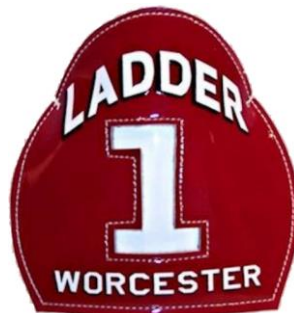
Standard Boston Style, Two Lines Painted Lettering Style #5016