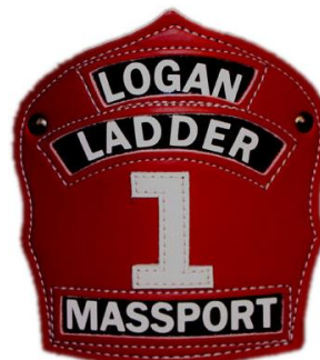
Standard Traditional Style, Three Text Panels Style #7019