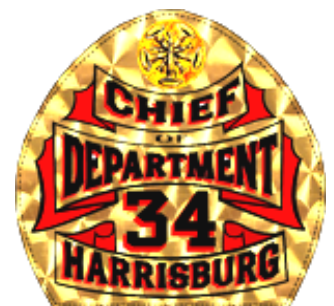
Standard Boston Style, Banner Style 8 Style #6018