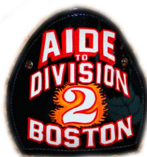
Standard Boston Style, All Painted Style #5019