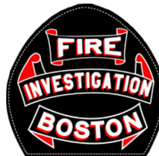
Standard Boston Style, Banner Style 7 Style #6017