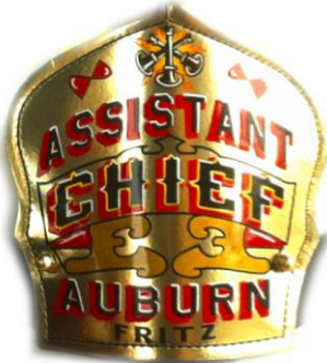
Standard Traditional Style, Banner Style 5 Style #8015